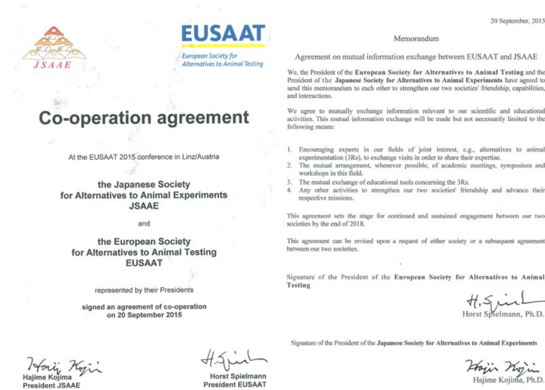
Photo. 2 The memorandum with EUSAAT